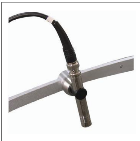
Microphone Mounting for MF710