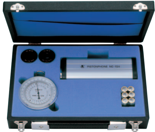
Carrying case (supplied)

NC-72A is designed to generate sound that has a sound pressure level of 114 dB(nominal) at 101.325 kPa of atmospheric pressure. Depending on the barometric pressure, the unit may need compensation. For this purpose, a barometer is supplied with the unit.