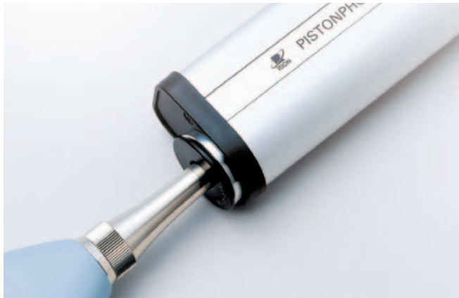
Usage example (NL series)

Carefully insert the microphone all the way into the coupler. Then simply turn the power on to apply a constant sound pressure level to the diaphragm of the microphone. The 1/2 and 1/4 inch microphones can be used after the supplied adaptor is installed in the coupler.