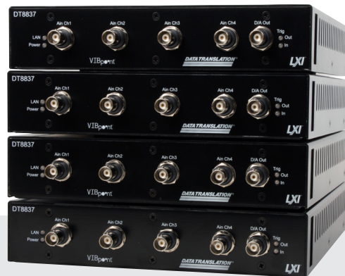
VIBpoint-DT8837 front panel with BNCs for direct connection to IEPE sensors. This Ethernet configuration can be stacked (4U, 1/2 rack, as shown) or rack-mounted with instrument modules in a 2U, full rack.